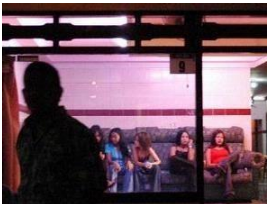
Figure 1 The atmosphere of a brothel in Dolly at operational hours

for many, not only for commercial sex workers, but also owners of stalls, cigarette vendors, parking attendants, motorcycle taxis, and becak drivers. This localization is the largest prostitution area in Southeast Asia even in Asia greater than Phat Pong in Bangkok, Thailand, and Geylang in Singapore. At least, statistics say more than 9000 prostitutes work in this area. The prostitutes come from Semarang, Kudus, Pati, Purwodadi, Nganjuk, Surabaya, Kalimantan and other regions in Indonesia. Even a small prostitute is an illegal immigrant from China and some small countries in the Middle East which are directly adjacent to the European continent. Nevertheless, the information is incorrect because there is no official comparative record between the Dolly region and the complex localization in other countries, such as the Phat Pong area in Bangkok, Thailand, and Geylang in Singapore. There has even been controversy because of the proposal to enter Gang Dolly as one of the tourist destinations of Surabaya for foreign tourists. Here is an overview of the Dolly area during operational hours, where prostitutes who are selling themselves "on display" in a glass-like room in front of the store.